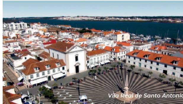
Vila Real de Santo Antonio

Praia de Manta Rota. To get there, as indicated above, take the second exit off the motorway and take