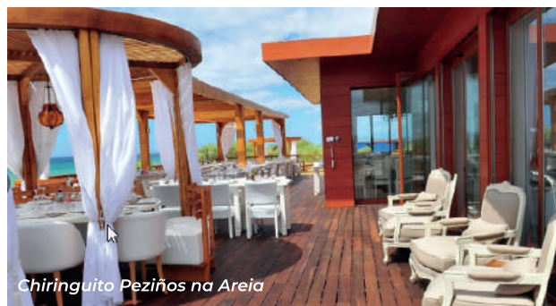
Chiringuito Pezinhos na Areia

In Praia Verde, below O Infante restaurant. Panoramic view. Ideal for dinner. I love it. It is one of my favourites. In addition to the fish, you can eat spaghetti with clams and prawns with curry rice that will take your breath away! The place is ideal... Romantic night, here without a doubt... Price a bit high.